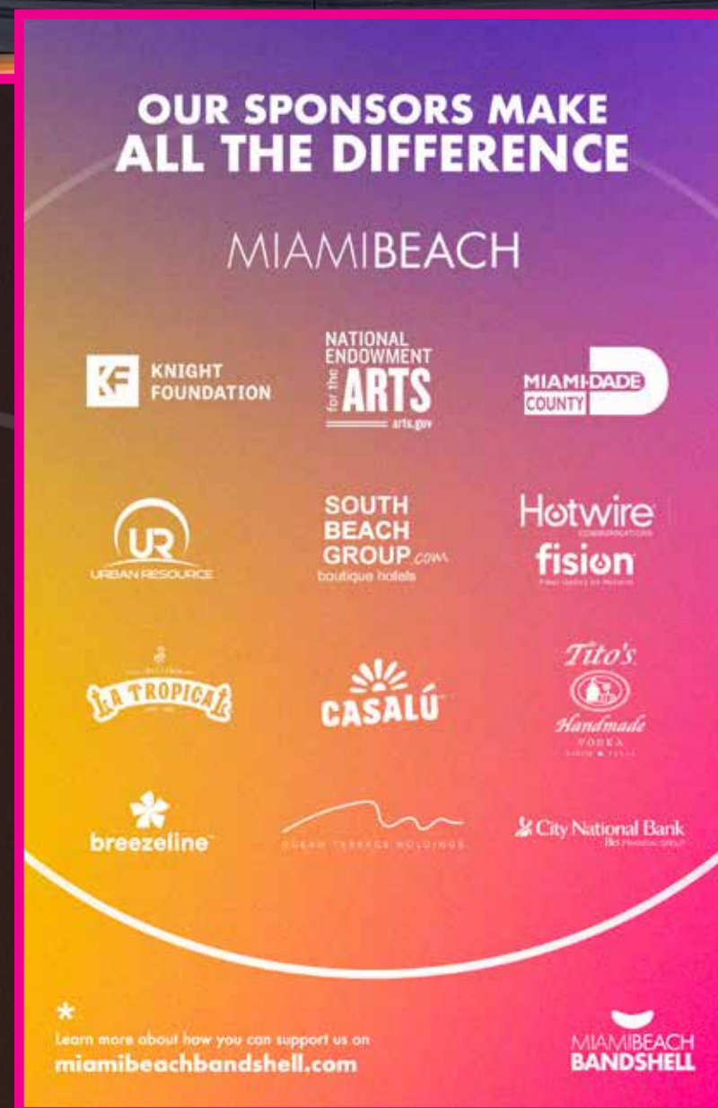
Logo on posters, MB Magazine ad, and rack cards.